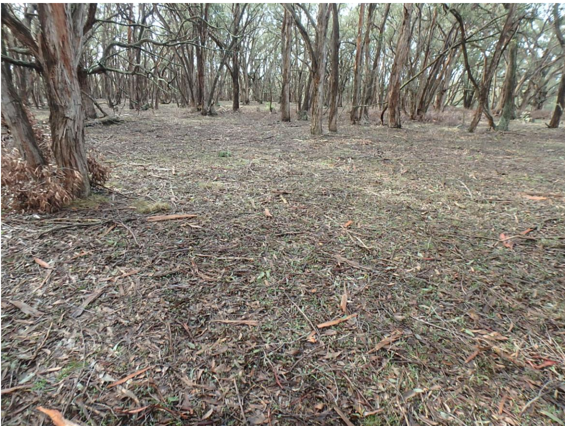
Plate 2. Ridge crest in approximate centre of subject land.