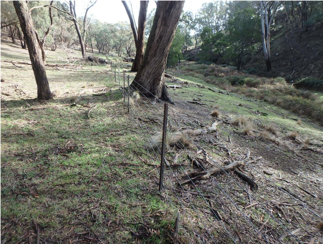
Plate 1. Part of the subject land fronting the Moorabool River.