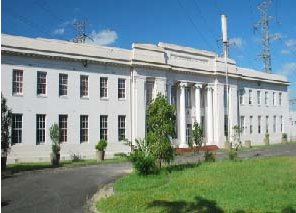
Plate 3: Former Yallourn Power Station Administrative Building adjacent to site

Use or disclosure of data contained on this sheet is subject to the restriction on the distribution page of this document.