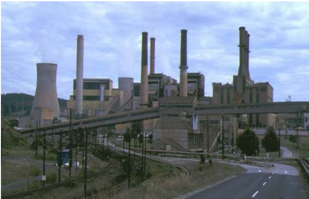
Plate 2: TRUenergy-Yallourn W Power Station adjacent to site

Use or disclosure of data contained on this sheet is subject to the restriction on the distribution page of this document.