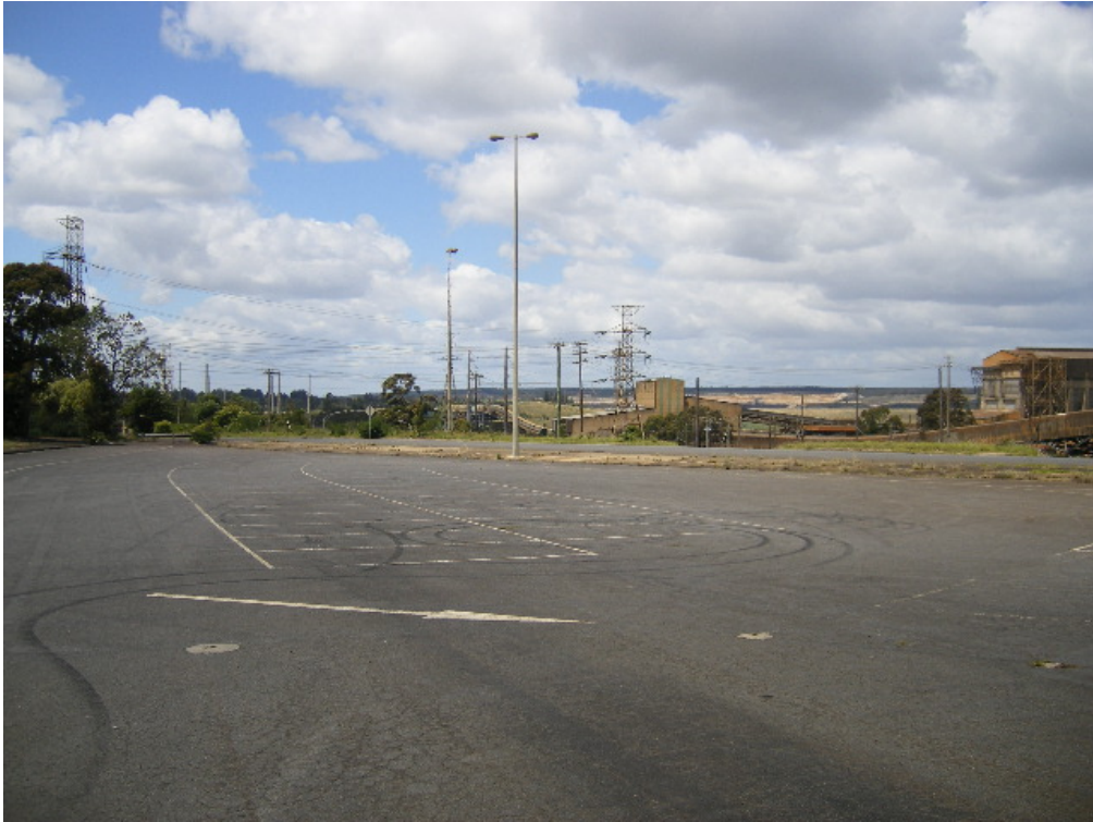
Plate 1: Former Yallourn Carpark, where facility will be located