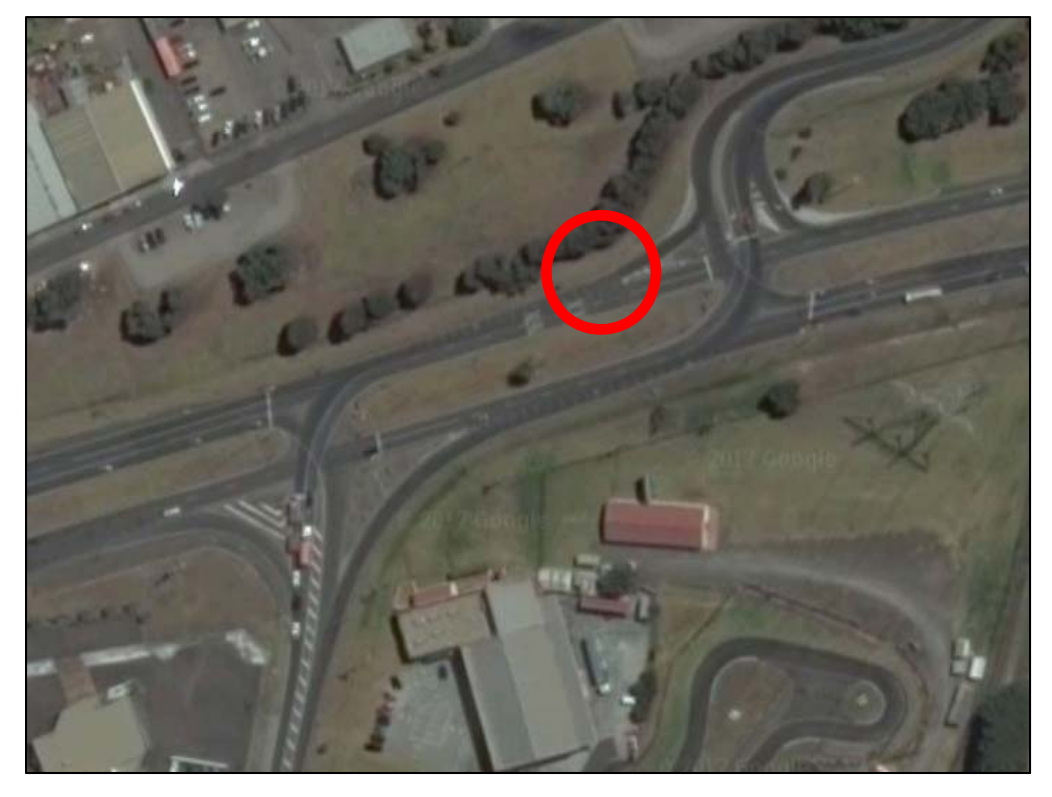
Figure 4.1 : Speed restriction sign on left-turn into Alexanders Road from Princes Drive, Morwell

Figure 4.2 : Layout of intersection of Alexanders Road, Princes Drive and Tramway Road