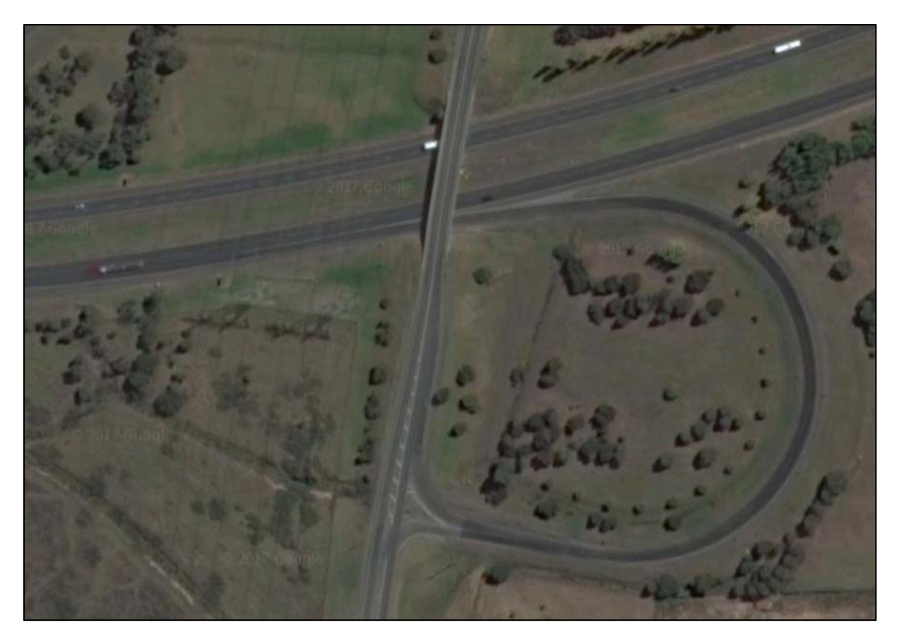
Figure 4.3 shows the approach ramp to the Princes Freeway westbound towards Melbourne from Tramway Road. The left-turn from Tramway Road and the ramp itself is steep, and further analysis may be required to check its suitably for 'over-dimensional' vehicles.