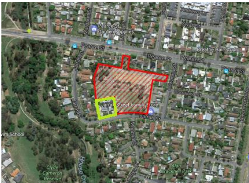
Figure 2 24 Jarrah Street, Wodonga

24 Jarrah Street is located immediately south-east of the site, as shown in Figure 2. The site is owned by DHHS.