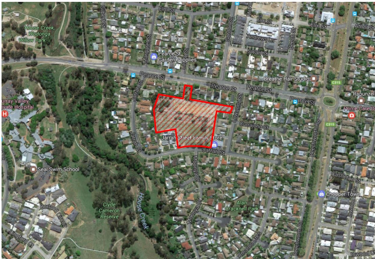
Figure 1: Site location

The lot fronting Pearce Street is affected by a covenant which seeks to restrict development of the land to one building plus outbuildings.