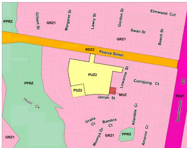
Figure 3: Current zoning