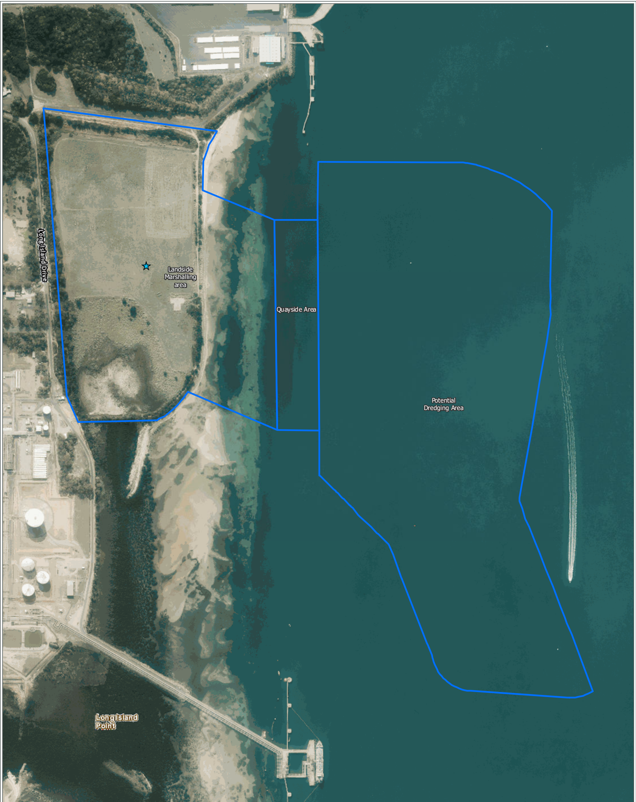
Figure 1: Project area

Project: Port of Hastings Client: Arup Australia Services Pty Ltd Date: 25/11/2022