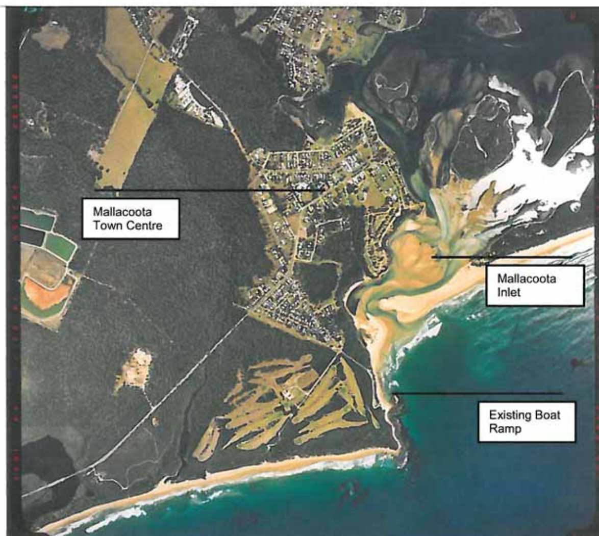
Figure 1. Project Location

Proposals to construct an Ocean Access Boat Ramp (OABR) at Mallacoota have been under consideration within the Mallacoota community from the time that they were first proposed by the Shire of Orbost in 1990. The East Gippsland Shire Council (EGSC) has latterly undertaken the vexed role of proponent for the current project in order to enable a decision on the availability of an acceptable option for development of a new breakwater and boat ramp, with associated road access and parking. The proposed OABR site at Bastion Point is approximately 1.5 km south of Mallacoota and 520 km east of Melbourne. See Figure 1.