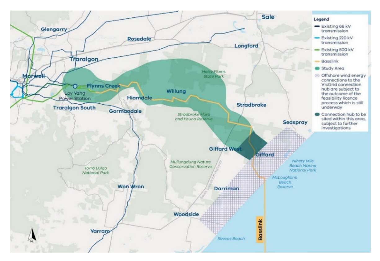
Figure 1: Study area and indicative connection hub