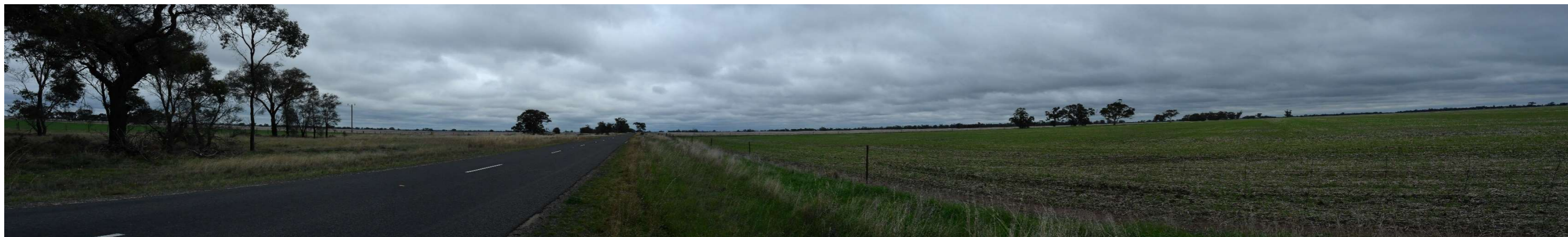
VP8 - Borung Highway #2 – east of Warracknabeal