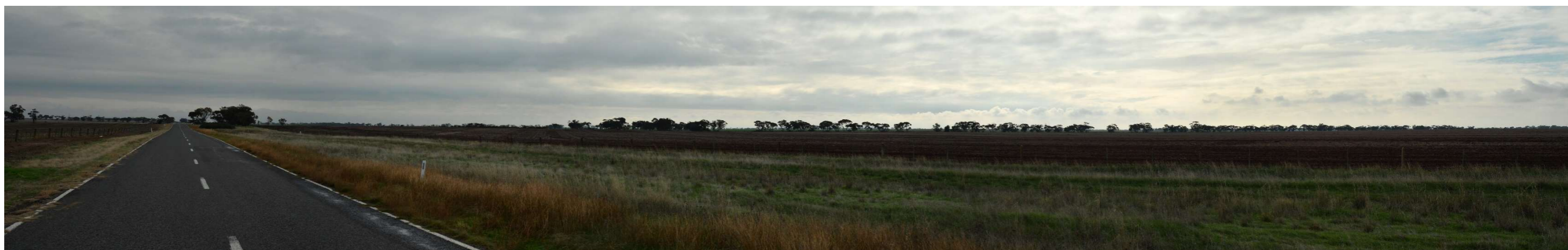
VP26 - Rainbow Road, north west of Warracknabeal