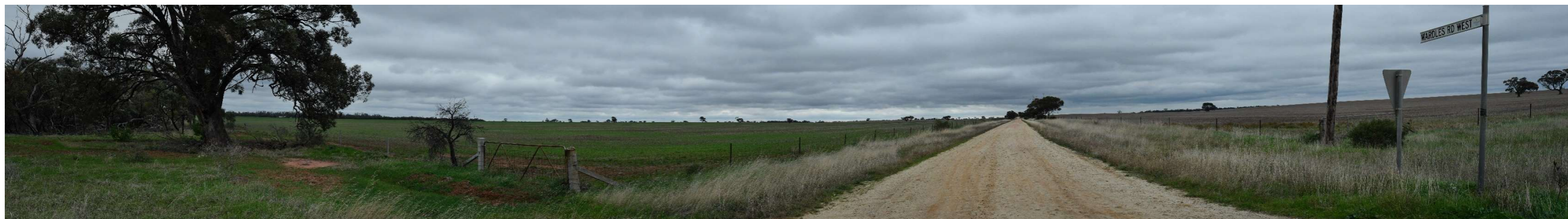
VP11 - Henty Highway #5, intersection of Wardles Road West