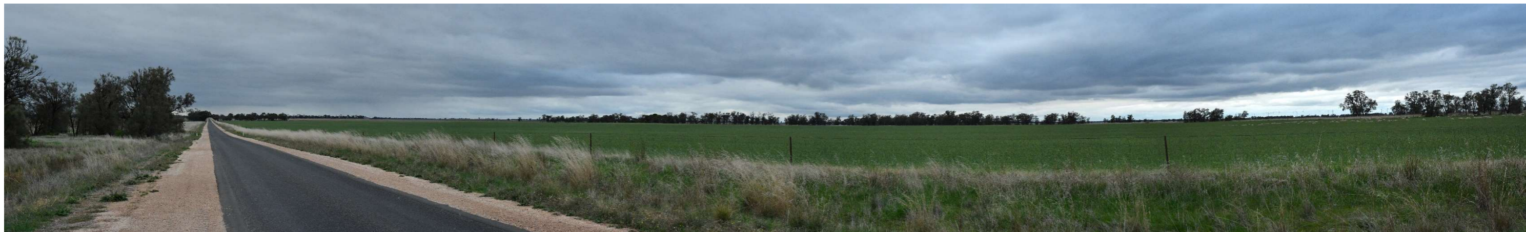
VP21 - Borung Highway #3, intersection with Katyil-Wail Road