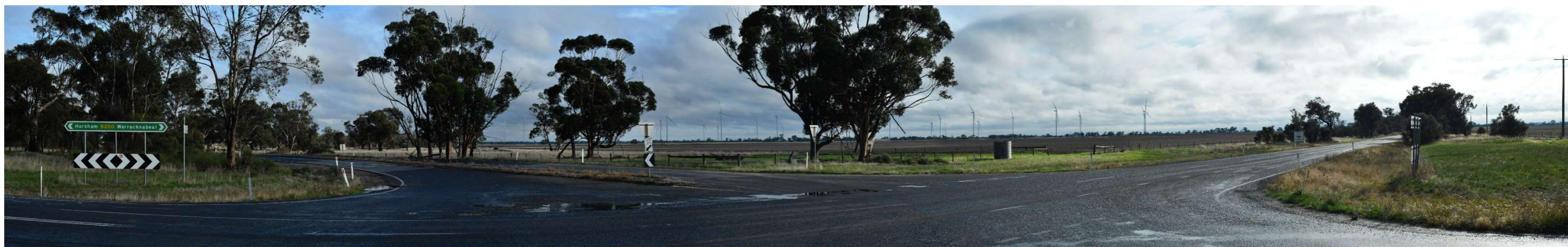
VP2 - Junction Henty Highway & Minyip-Dimboola Road