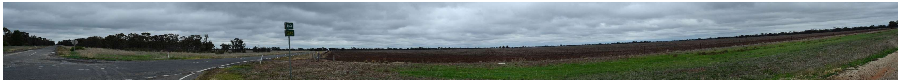
VP9 - Warracknabeal-Birchip Road, north east of Warracknabeal