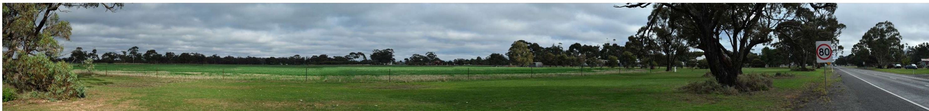
VP5 - Henty Highway#2, south of Warracknabeal