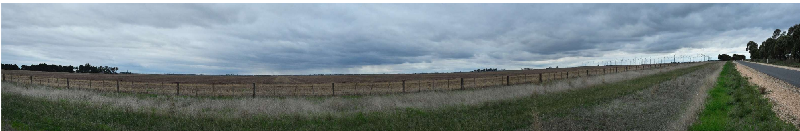
VP19 - Old Minyip Road, east of Dimboola