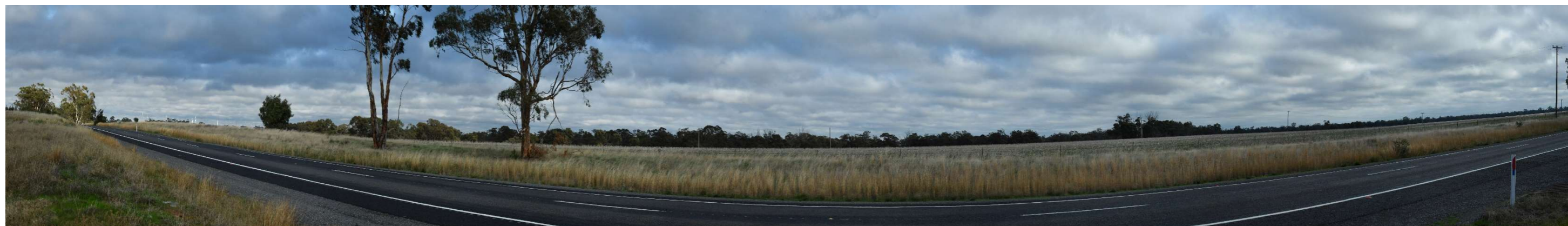
VP3 - Ailsa Road, west of Inksters Road