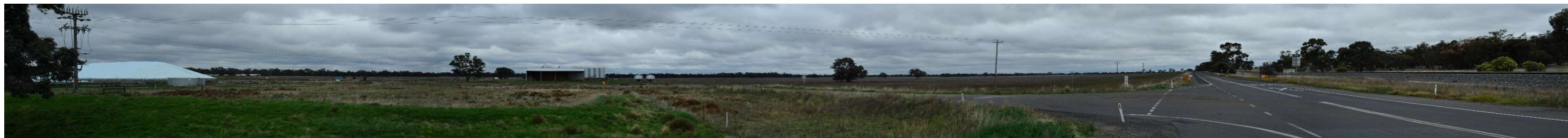
VP7 - Henty Highway #3 – north of Warracknabeal