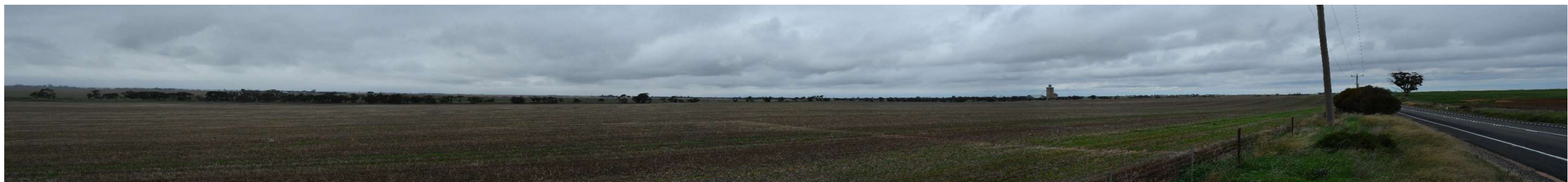
VP14 - Dimboola Rainbow Road # 1, east of Lake Hindmarsh