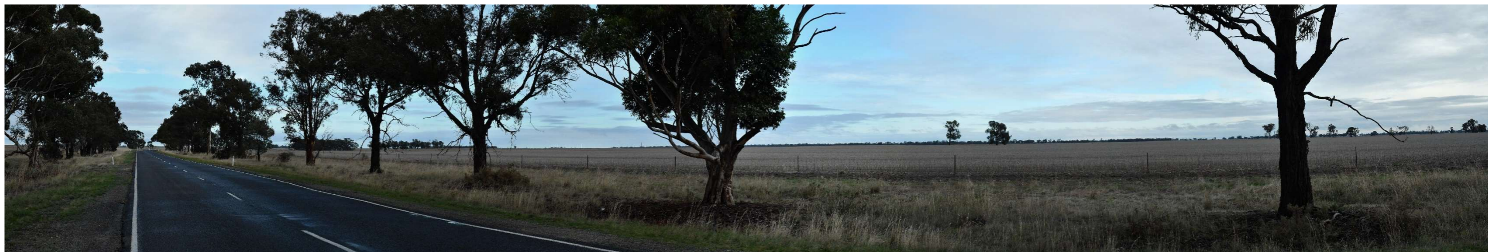
VP1 - Donald-Murtoa Road, west of Minyip