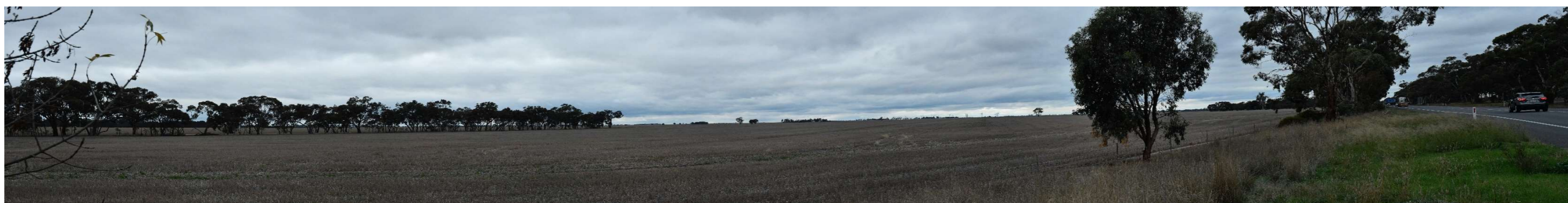
VP18 - Western Highway #2, south of the Borung Highway intersection at Dimboola