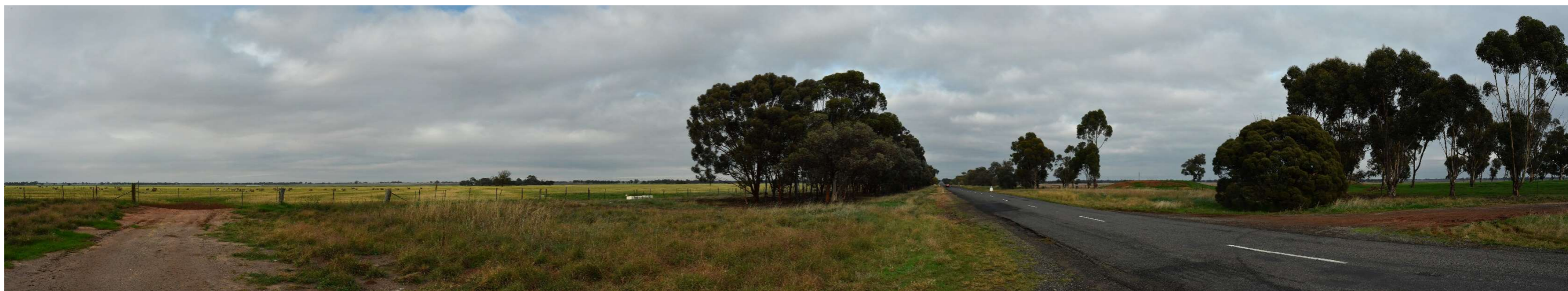
VP24 - Borung Highway #6, looking south west towards the Murra Warra Wind Farm