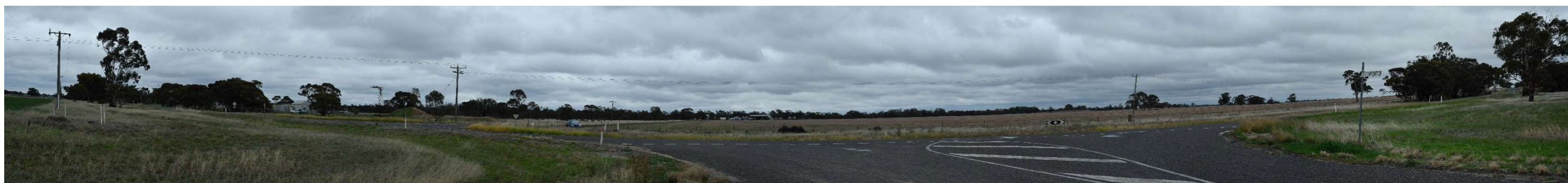
VP10 - Henty Highway #4, at Lah, north of Warracknabeal