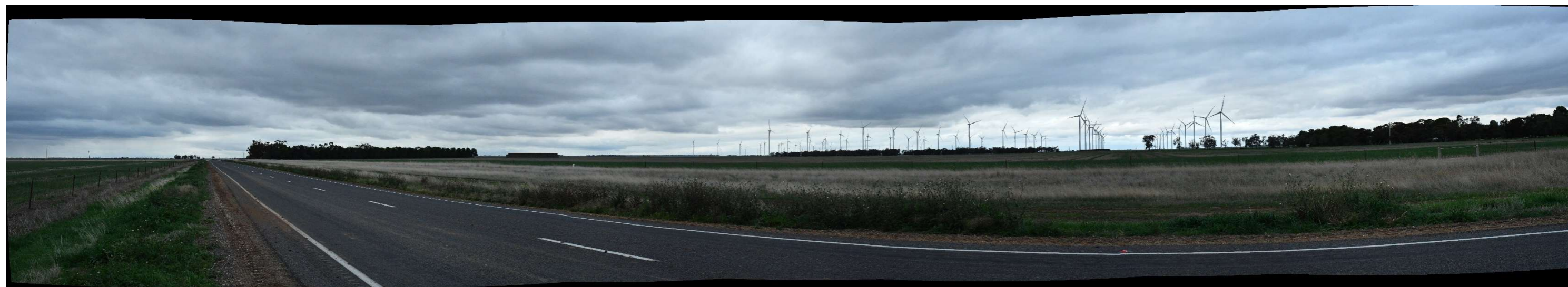
VP20 - Blue Ribbon Road, north of Old Minyip Road and the Sailors Home Hall