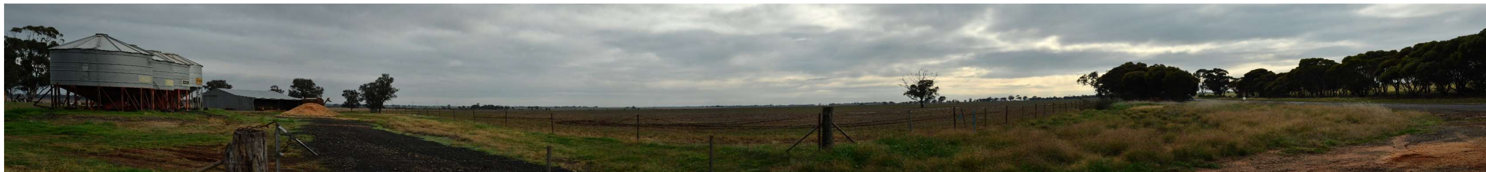
VP23 - Borung Highway #5, looking north