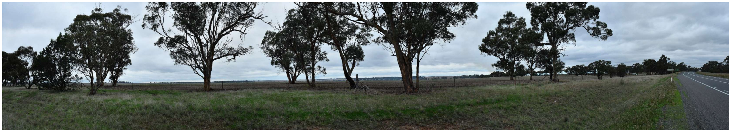
VP17 - Western Highway #1, north of the Borung Highway intersection at Dimboola