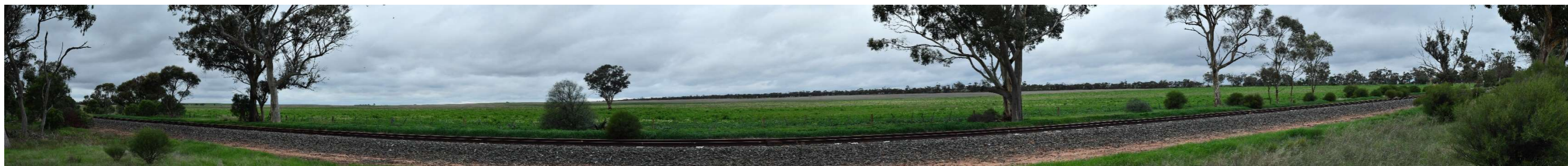
VP16 - Dimboola Rainbow Road # 3, at Antwerp