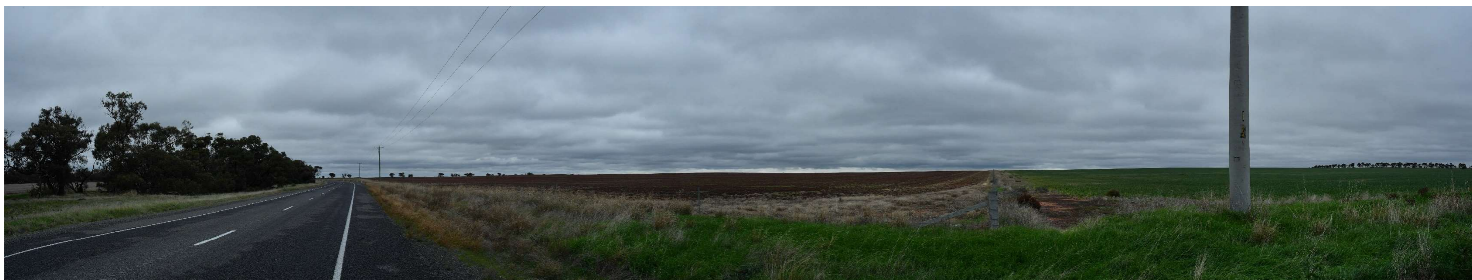
VP12 - Henty Highway #6