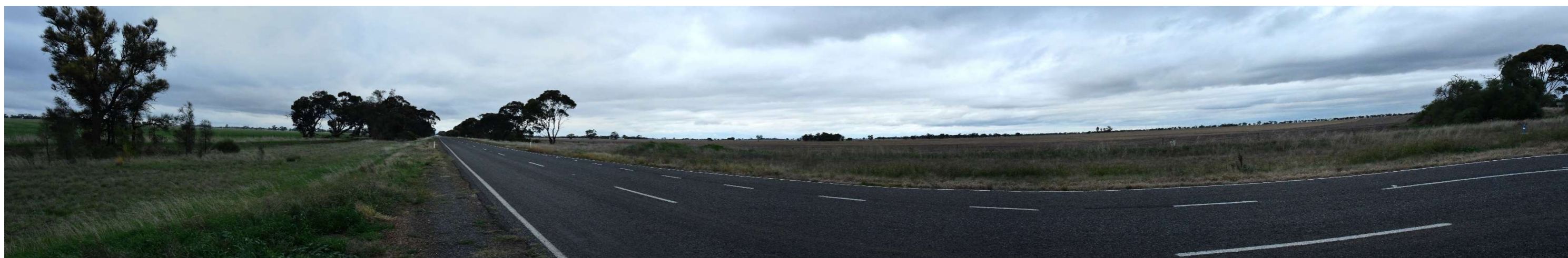
VP22 - Borung Highway #4, intersection with Blue Ribbon Road