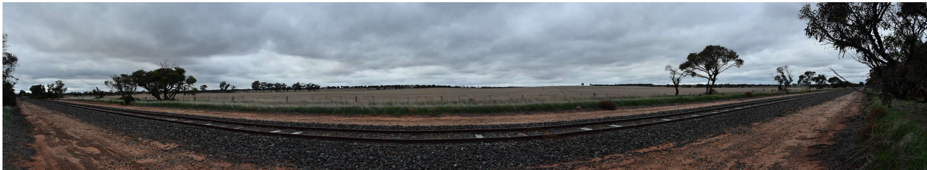
VP15 - Dimboola Rainbow Road # 2, south east of Lake Hindmarsh