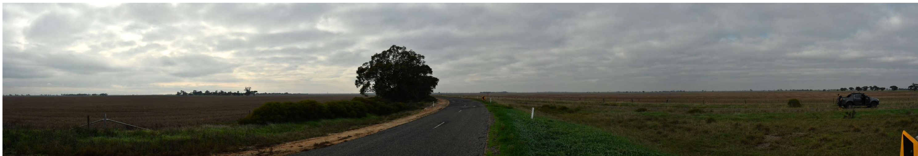
VP25 - Jeparit-Warracknabeal Road, north west of Warracknabeal