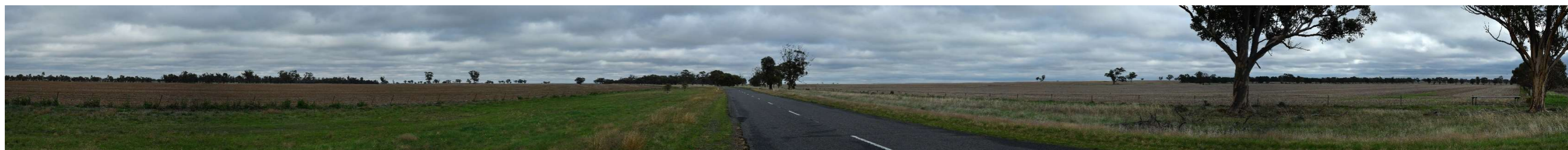
VP6 - Borung Highway #1 – west of Warracknabeal