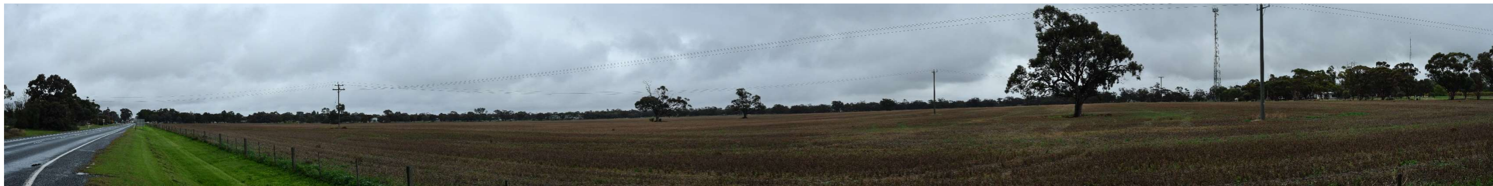
VP13 - Henty Highway #7, at Beulah