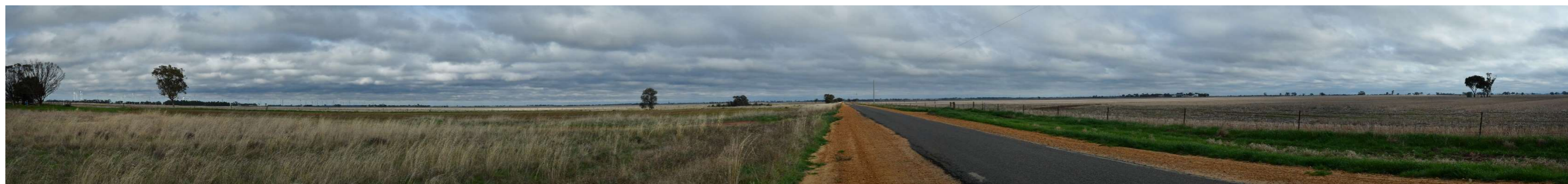
VP4 - Henty Highway#1, outside Warracknabeal aerodrome